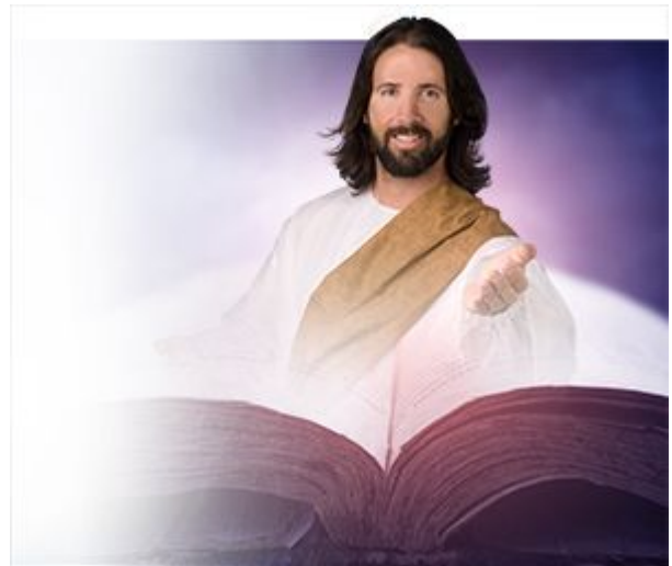
Jesus is the author of Scripture.

"The prophets have inquired and searched carefully ... searching what, or what manner of time, the Spirit of Christ who was in them was indicating when He testified beforehand the sufferings of Christ and the glories that would follow" (1 Peter 1:10, 11).