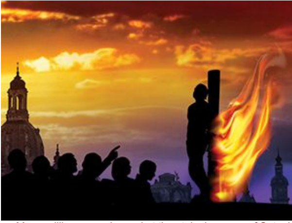
Many millions were burned at the stake because of Satan's persecution.