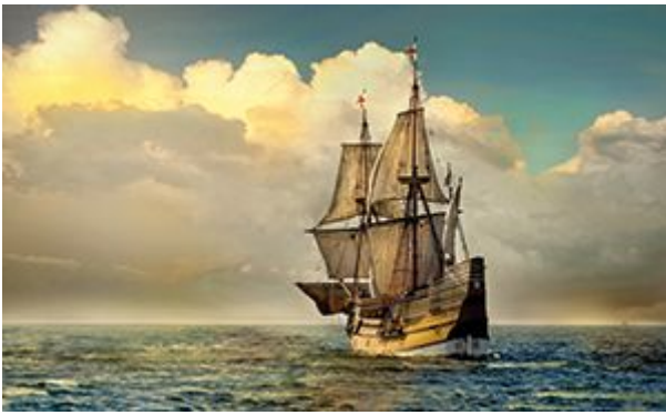
Many of God's people fled to the United States to escape terrible persecution.

prophetic day equals one literal year (Ezekiel 4:6).