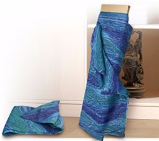
A remnant of cloth is the last remaining portion of a bolt. It matches the first piece from the same bolt.

8. In Revelation 12:17, God calls His end-time church the remnant [KJV]. What does the word “remnant” mean?