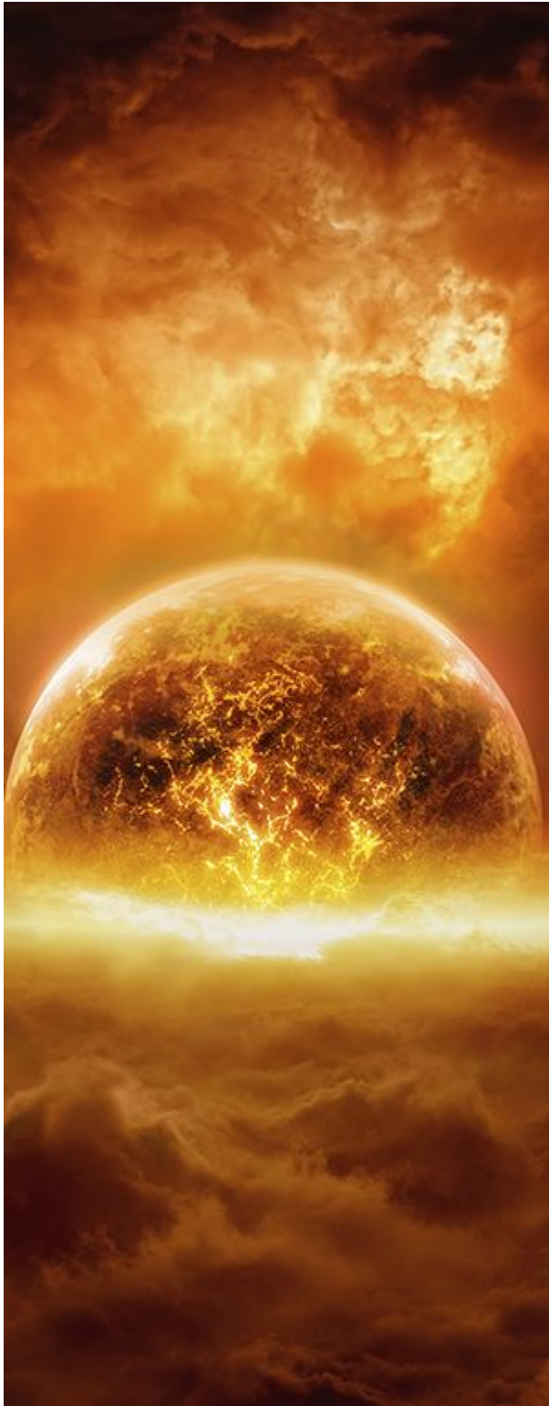
Sin and sinners will be eradicated by fire from God.