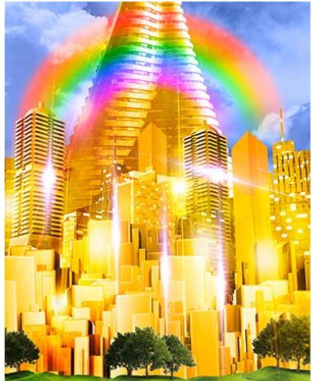
God is the architect and builder of the holy city.

Answer: The Bible says that God is building an awesome and huge city for His people—and it's as real as any other city in the world!