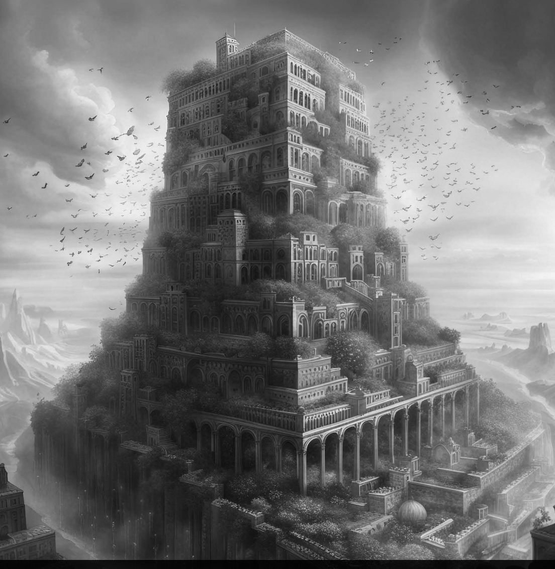
Copyright © 2023 Amazing Facts International; P.O. Box 1058, Roseville, CA 95678; amazingfacts.org. Scripture is taken from the New King James Version'. Copyright © 1982 by Thomas Nelson. Used by permission. All rights reserved.

What is this end-time Babylon, and what does it have to do with your eternal destiny?