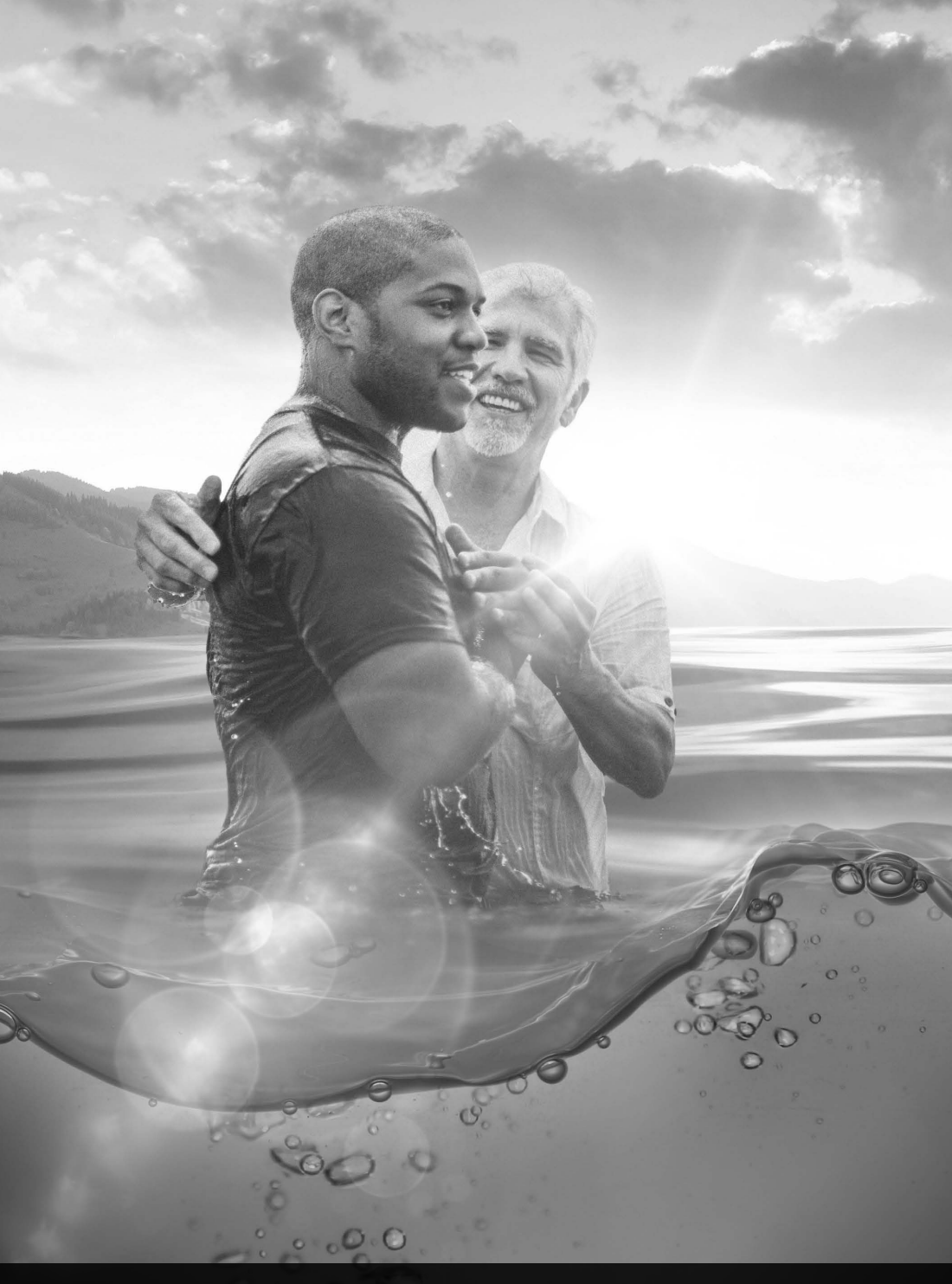
Copyright © 2023 Amazing Facts International; P.O. Box 1058, Roseville, CA 95678; amazingfacts.org. Scripture is taken from the New King James Version*. Copyright © 1982 by Thomas Nelson. Used by permission. All rights reserved.