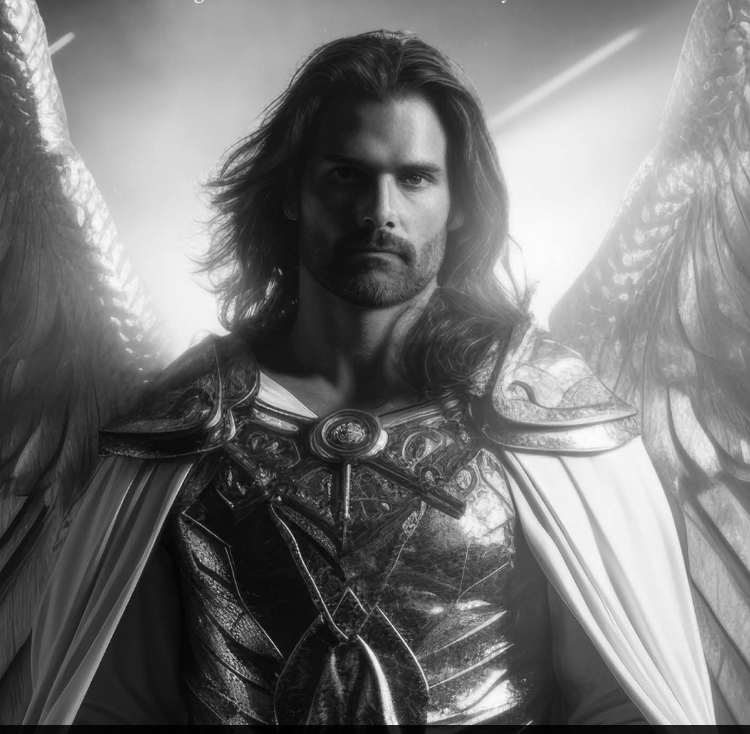
Copyright © 2023 Amazing Facts International; P.O. Box 1058, Roseville, CA 95678; amazingfacts.org. Scripture is taken from the New King James Version*. Copyright © 1982 by Thomas Nelson. Used by permission. All rights reserved.

What else does the Bible say about angels? Understanding their origins, and Satan's in particular, will help you to better understand the battle between good and evil in Revelation—and in your life.